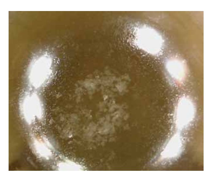
FIGURE 1. White particulate matter as well as gel droplets floating on the surface of a heparin-plasma tube (picture taken with a USB microscope camera).

After staining the white clots with a May-Grünwald-Giemsa stain and evaluating them under the microscope, we identified it as a conglomerate of fibrinogen, platelets (PLT) and some leukocytes (WBC), described as "white particulate matter" (WPM). The fat droplets most probably originated from the separator gel in the tubes. We concluded that these structures floating on the surface of the heparin tubes were sufficient to form a temporary clot in the pipetting needle, whereby the sampling volume was significantly altered. As a result